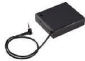
Backup battery pack

If your package is missing any of these items, please email us at support@tacticaltraps.com